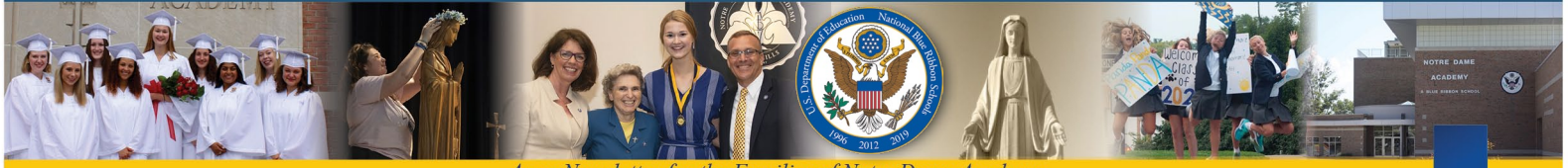
An e-Newsletter for the Families of Notre Dame Academy